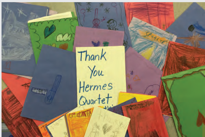
Thank-you letters from students in Florida.

Engage artists for reasonable fees and free educational outreach days. Call us today!